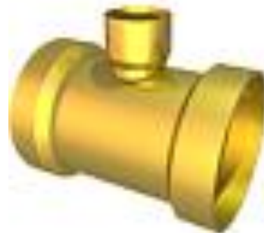
Figure 3 Typical Flow Control Device