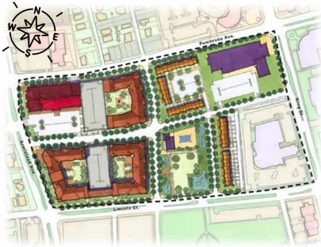
Downtown Master Plan Concept

114 Lincoln St. is located on a prime parcel on the former Harbor Square site in Downtown Hampton . The parcel is located half a block to the west of the recently constructed Hampton Circuit Court Building and the Hampton General District Court Building. Within two blocks is the Hampton City Hall, school administration building, police headquarters, and the city's original main street - Queens Street. This area is part of the downtown and included in the Downtown Master Plan . It has infrastructure as well as downtown zoning in place. This site could support a high-density mixed-use development and/or neighborhood retail/grocery.